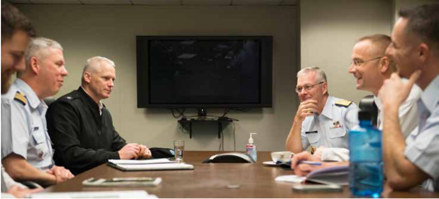
Brig. Gen. Graham meets with member of the U.S. Coast Guard during his trip to New England District.

operated by the District. Fox Point was built as a result of damages caused by the September 1944 hurricane that had the greatest known energy of any recorded storm along the Atlantic Coast. Fox Point was designed to withstand a storm of the magnitude of that hurricane. The barrier was constructed at a cost of $15 million and was placed into service in 1966. To date, the barrier has prevented over $3 million in damages.