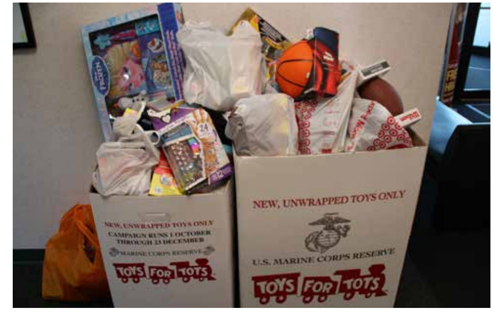
The Toys for Tots bins overflowed with gifts for needy children.

During the morning of the celebration, New England District team members were greeted in the lobby by a smiling Paige Kimbrough-Rowan who was offering New England District "Corps