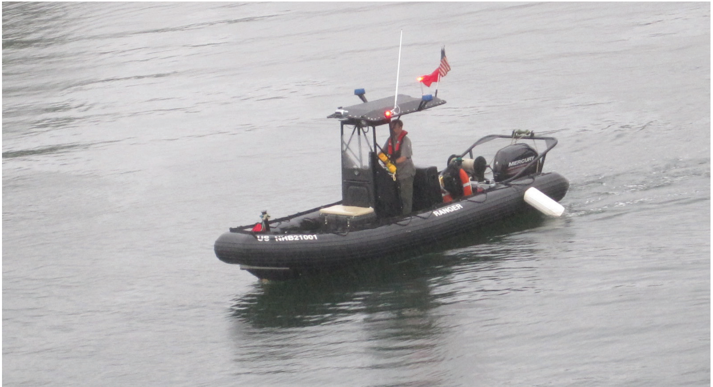
A New England District team member monitors the dewatering process at the Stamford Hurricane Barrier.