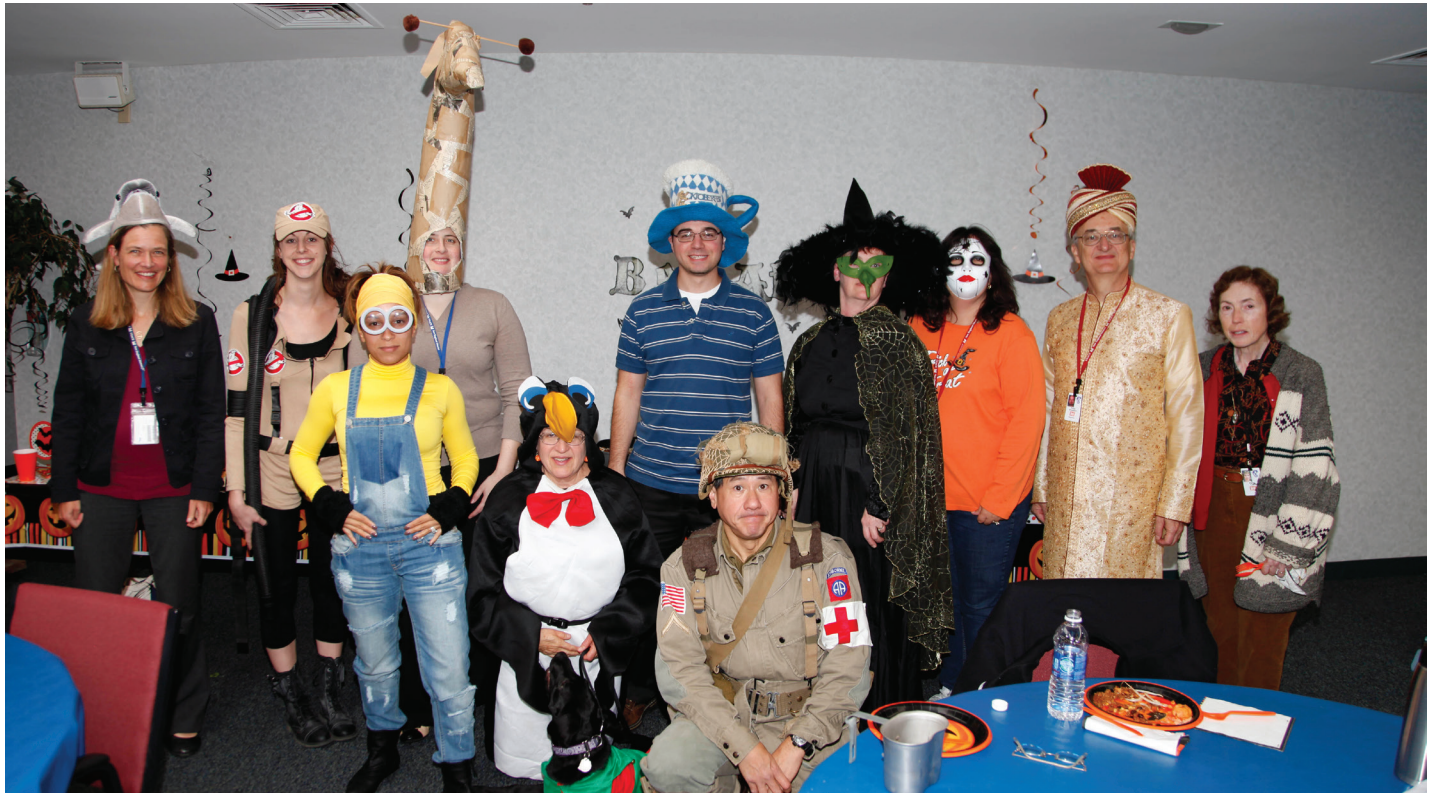
New England District team members pose in their costumes during the annual Halloween potluck lunch held in the cafeteria.