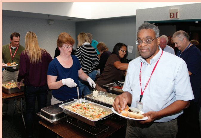
District employees enjoy a year end barbecue celebration.