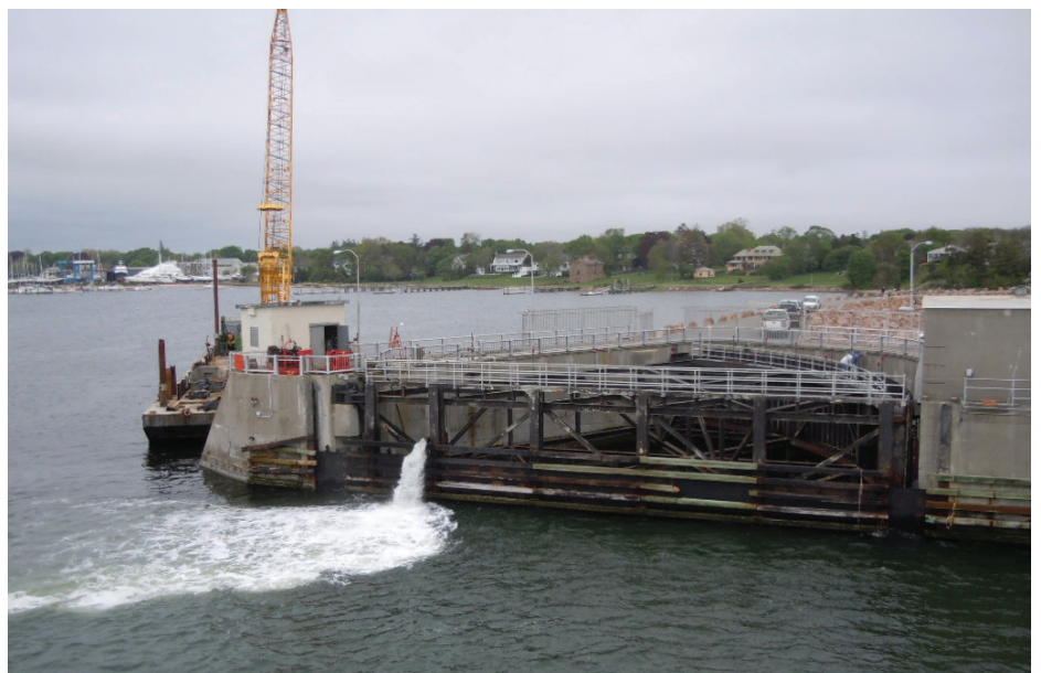
New Bedford Hurricane Barrier.

Fall River Electrical Associates, Incorporated of Fall River,