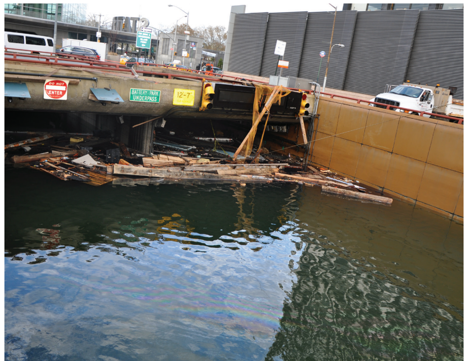
Hurricane Sandy caused massive flooding throughout parts of the Northeast.

The new maps, like previous ones, are being created using GIS