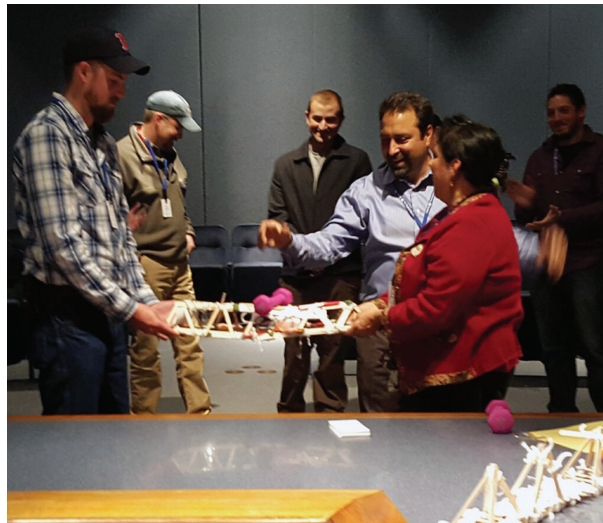
Park Rangers participate in the team building exercise.