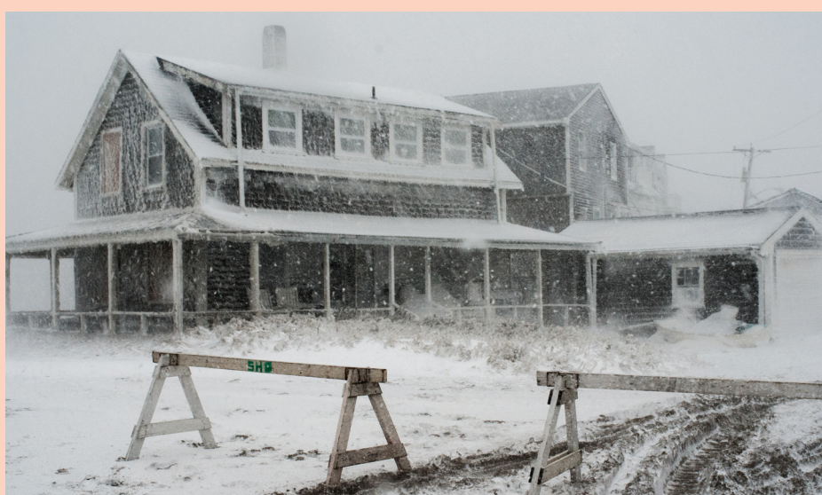
Blizzard of 2015