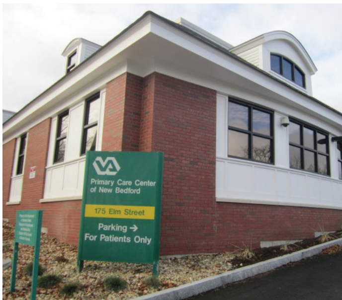
The entrance of the New Bedford Community-Based Outpatient Clinic in New Bedford, Massachusetts.