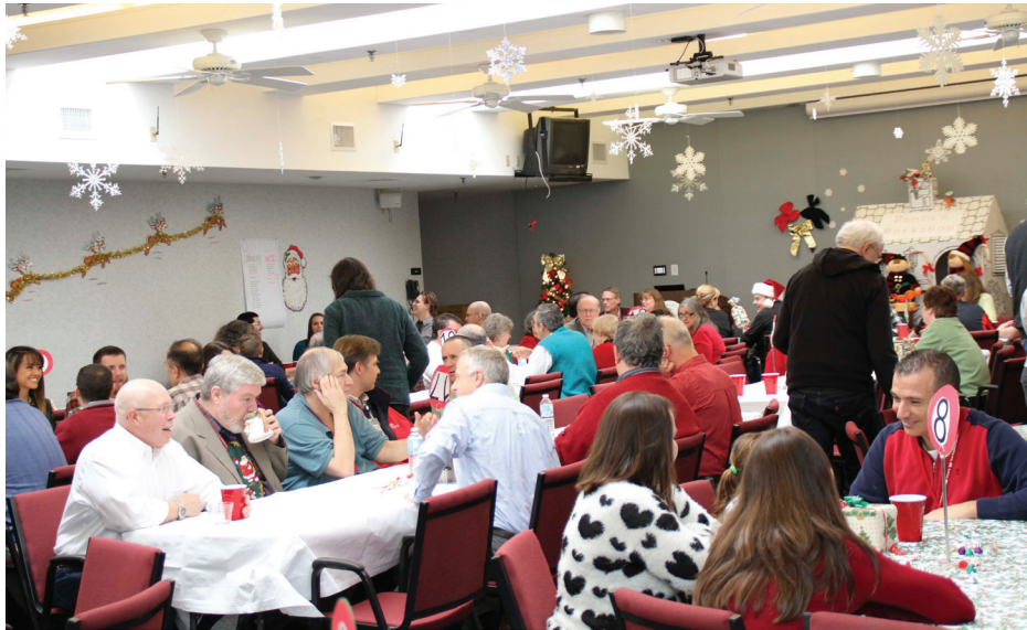
Holiday party attendees take their seats and begin the festivities.