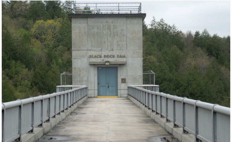
Black Rock Dam

Subdocuments created by team members would stay in the central location. When one team member is finished with a document and needs to