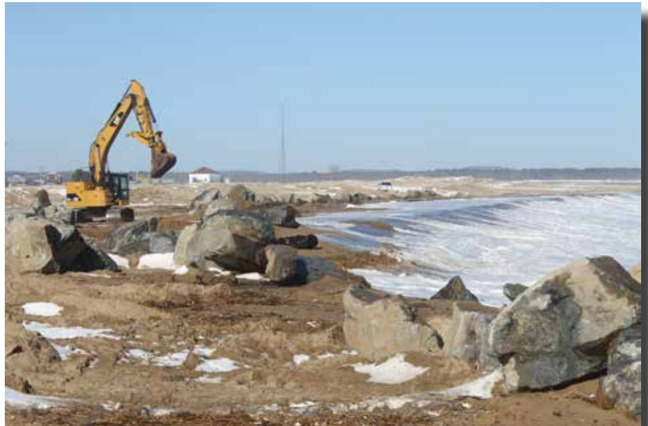
Work being performed on the Newburyport South Jetty in Newburyport, Mass.

embankment crest, to a new embankment downstream of the dam wall. After removing the national road from the dam crest, the crest width was narrowed by about 5.5 meters (18 feet). The dam embankment was then raised by 4 meters (13 feet) by making the slopes of the dam faces steeper (about 1:2) and minimizing the expansion in the footprint of the dam on the ground. The impervious dam core was also raised to within one meter of the crest level. The downstream face was widened by the addition of a gravel aggregate layer, and by the inclusion of a mid-slope berm. Internal sand filters were installed on the downstream side of the core, connecting to a gravel drain that will link into a surface drain running along the berm to allow for any seepage through the dam to be safely collected. A new toe drain was incorporated into the downstream face, which will connect