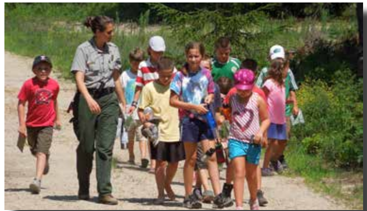
Junior Rangers Week