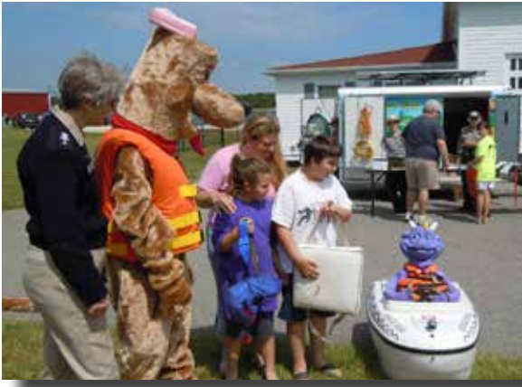
National Safe Boating Week at the Cape Cod Canal.