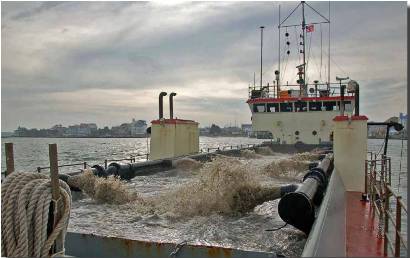
The Corps dredge "CURRITUCK" visited New England waters during the summer months to dredge several harbors.