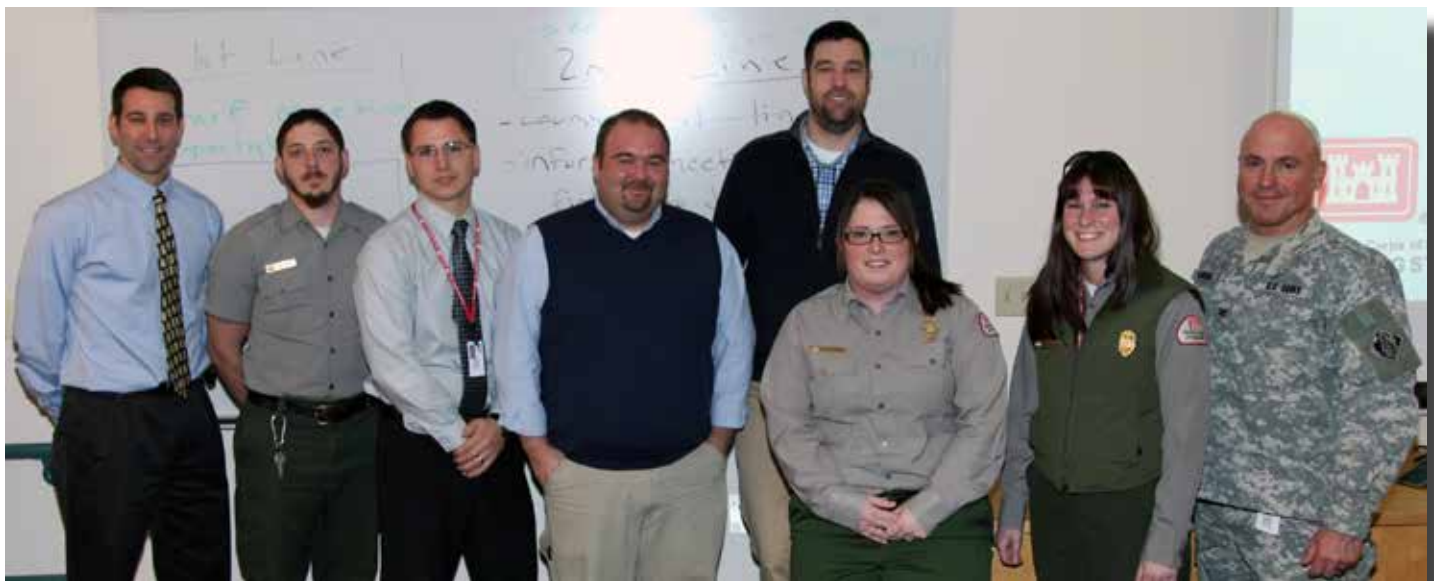
Leadership Development Program graduates.