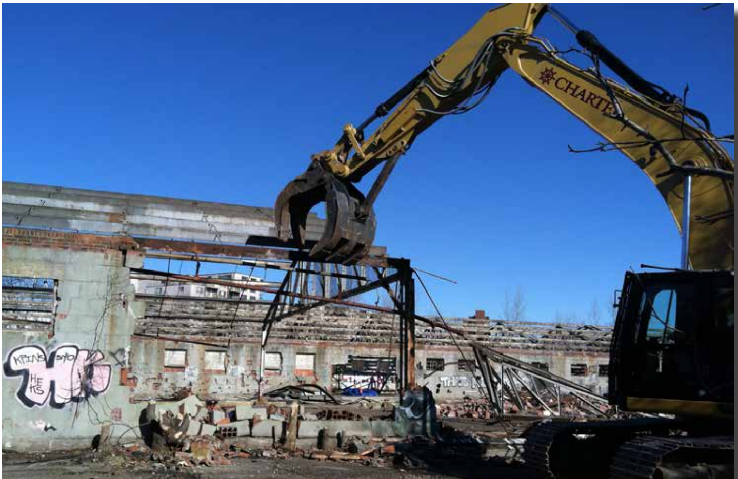
Buildings are demolished as part of the remedial action plan for the Watertown GSA Formerly Used Defense Site.