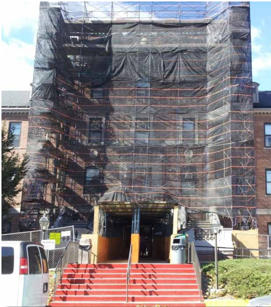
Facade work at the Veterans Administration Hospital in Bedford, Mass.

The New England District team also awarded a $1,698,134 contract to dredge about 114,300 cubic yards of sediment, out of the Scarborough River in Scarborough, Maine.