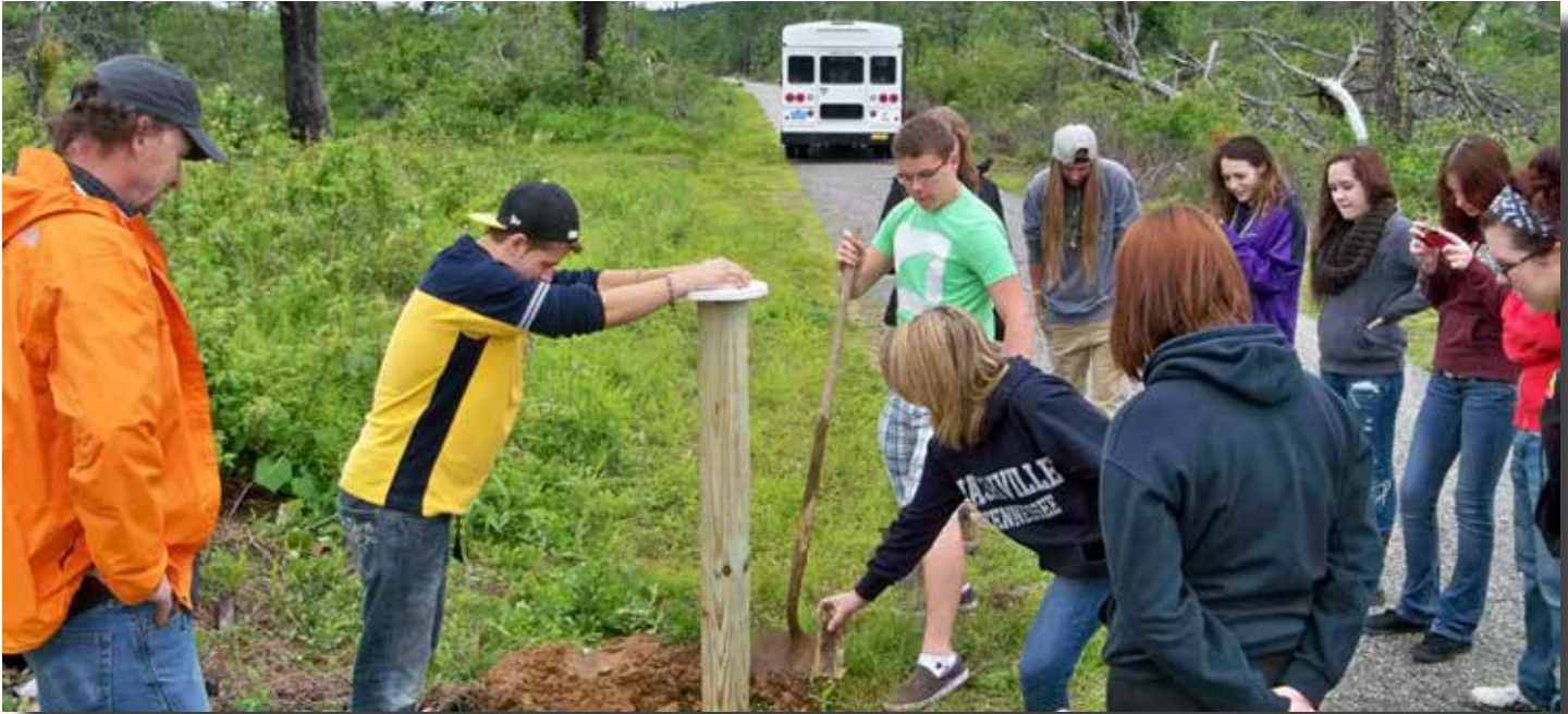
Students from Tantasqua Regional High School install the 360 degree photo post along the Grand Trunk Trail.