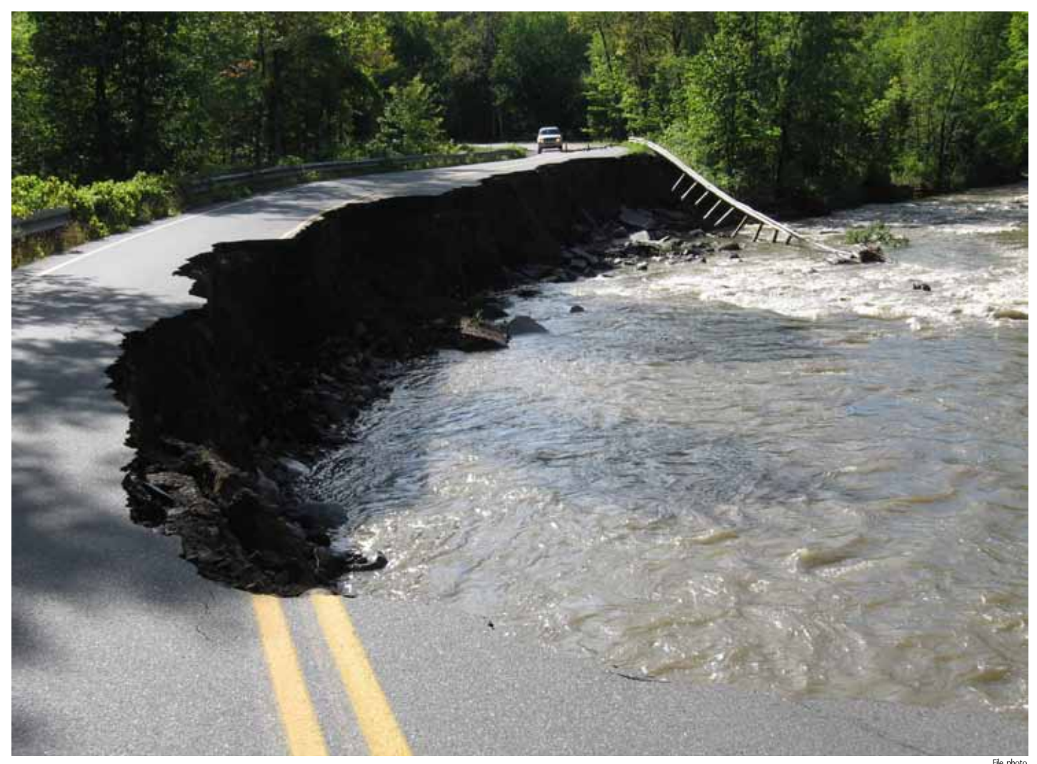
Hurricane Irene washed out many roads like the one above, causing delays hauling out material from Union Village Dam. Despite the challenges brought on by the storm, the District was able to complete the project on time.

The District and Tantara teams soon found that other challenges to get the project completed were before them: A near vertical wall in part of the channel blocked a clear line of sight; stirring up sediment in the water would cause too much turbidity; uncertainty over how quickly the sediment would dewater in the dewater ponds, and additional uncertainty regarding how much water it would produce. With each challenge came a solution: The contractor used a crane and a spotter to guide the crane operator; the contractor installed turbidity curtains and conducted turbidity monitoring, and an option (which was not required) was put into place for a pumping system to pump excess water onto the dam's