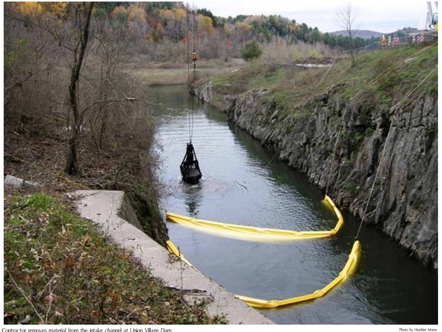
Contractor removes material from the intake channel at Union Village Dam.