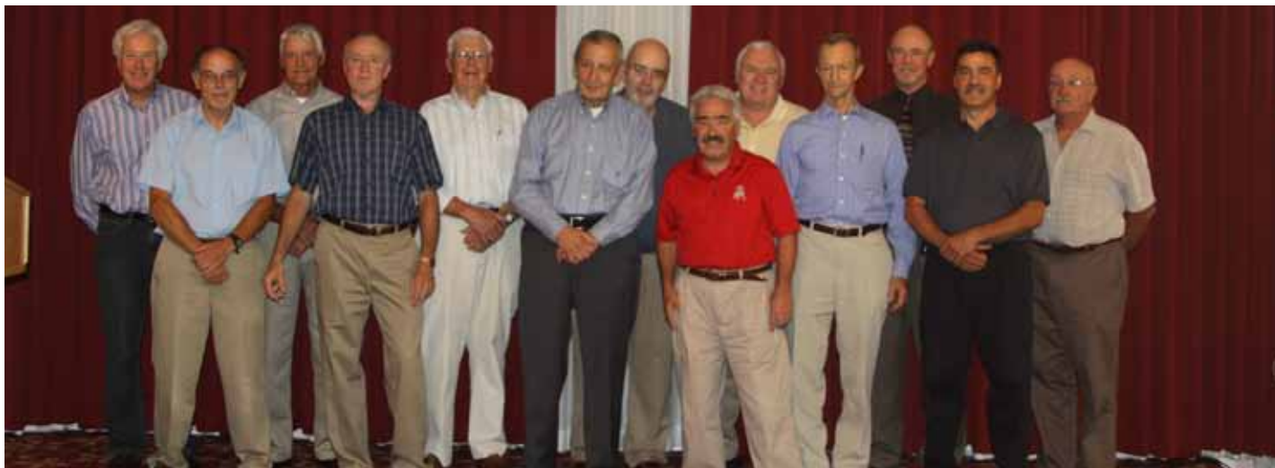
All of the attending retirees pause to pose for a picture during the retirement luncheon.