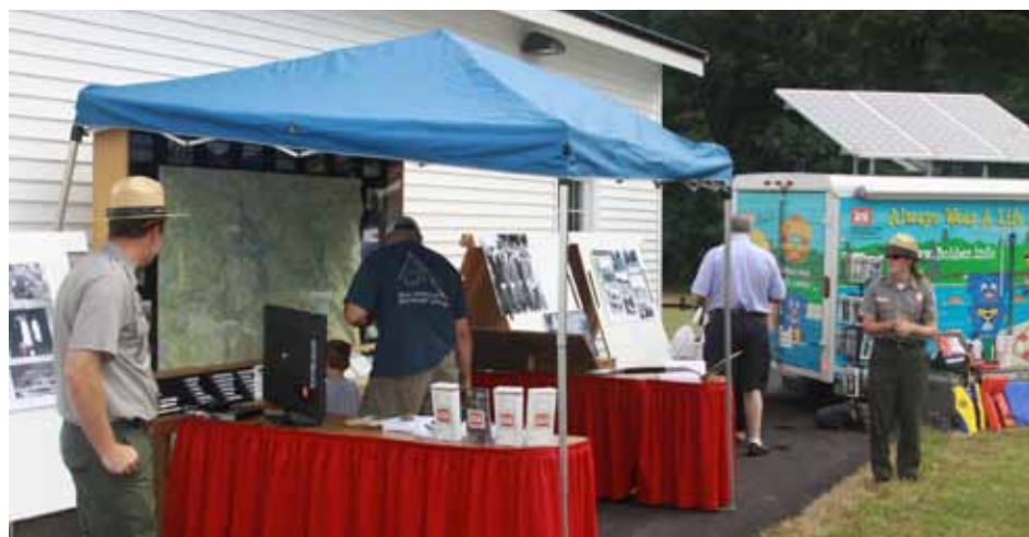
Attendees visit the many exhibits available at the event.