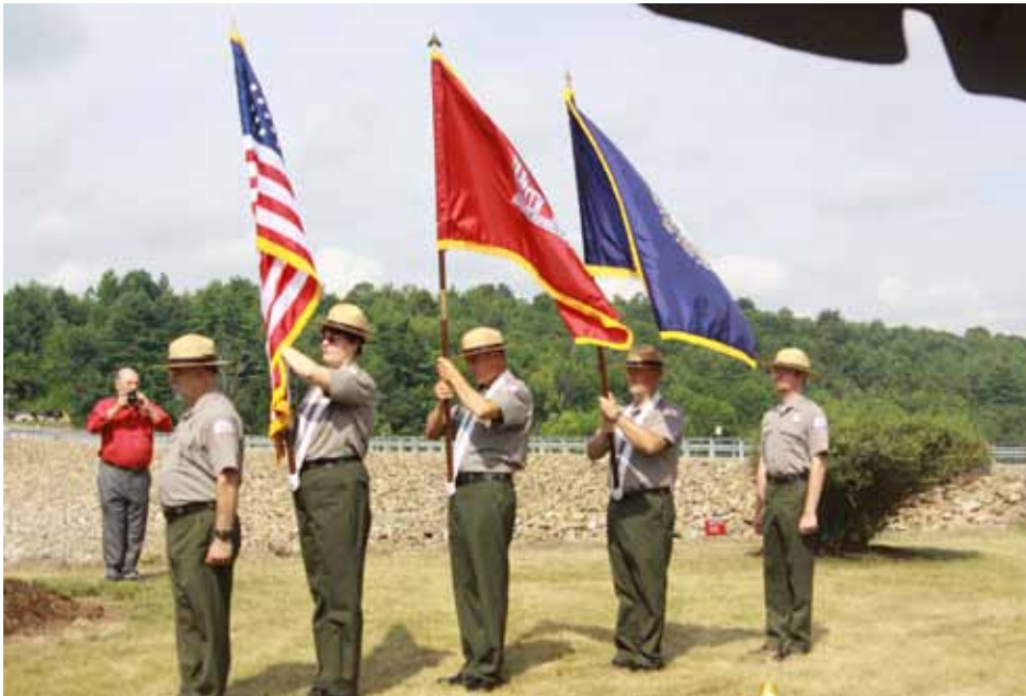
The New England District Ranger Color Guard opened and closed the official ceremony.

struction, and also of the original ground breaking ceremony that was attended by then Vice-President Richard Nixon. The Hopkinton Historical Society provided some historic photos and one of the ground breaking shovels to display. The Henniker Historical Society provided core samples taken prior to construction of the project.