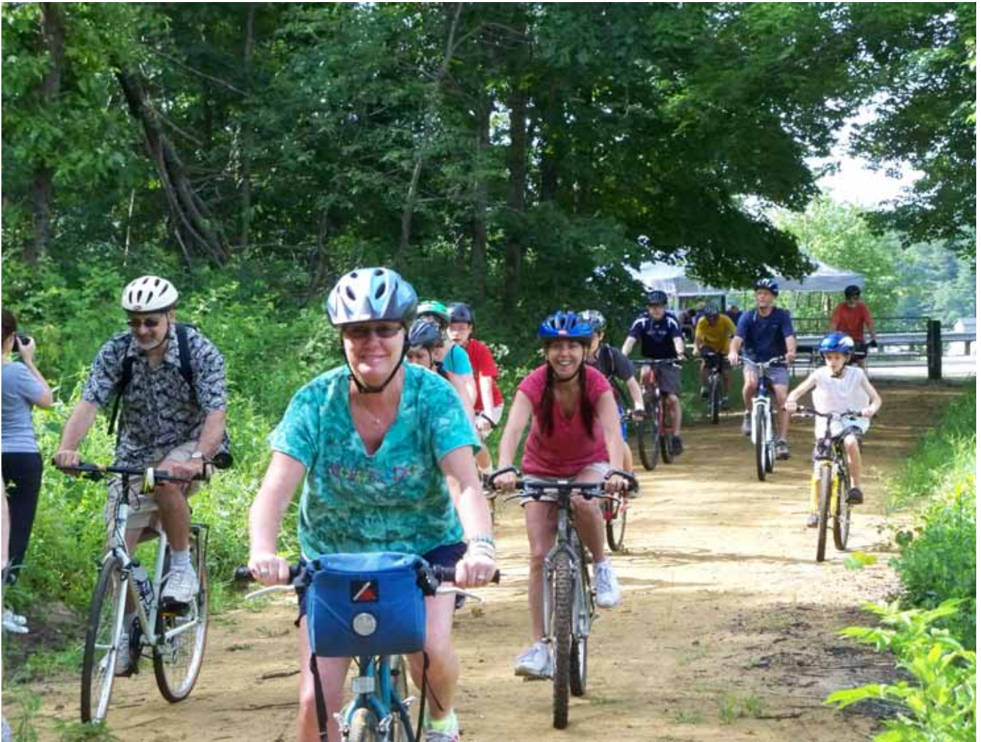
Bikers ride the 10-mile Holland Trail event at East Brimfield and Westville Lake.