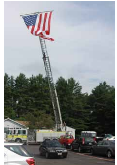
The Hopkinton Fire Department flies a large American flag in honor of Hopkinton-Everett Dam's 50th celebration.