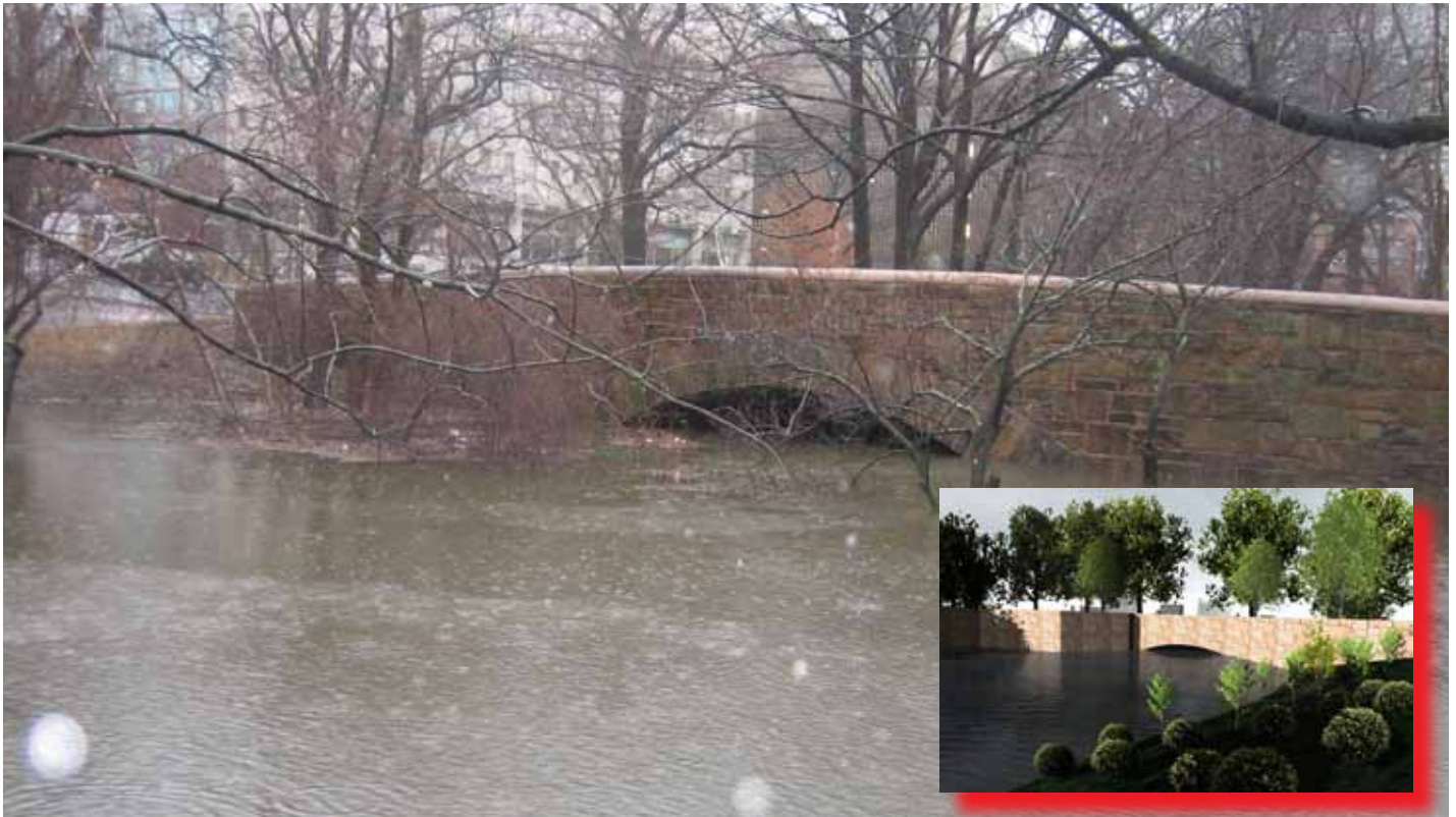
Flooding at the Netherlands Road Bridge. Inset: Artist rendition of a culvert set to be installed.