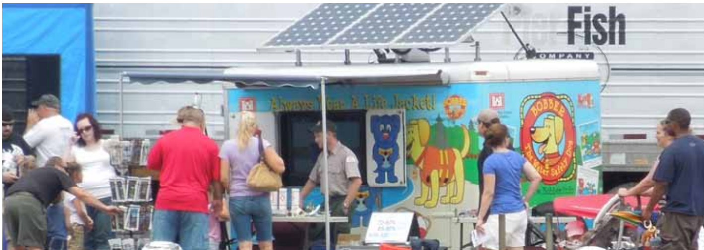
Crowds of people walk by the New England District Water Safety Trailer, with many stopping to pick up information and see Bobber.

Bobber and the Canal Team were personally invited by the Plymouth Chamber of Commerce, who were thrilled when they accepted. Bobber and the team knew it would be a good venue to get out the Water Safety message, which is so important to the U.S. Army Corps of Engineers. "The trailer is such a good tool for attracting people and getting our message out," said Carey. "The event was a great way to help promote Water Safety!"