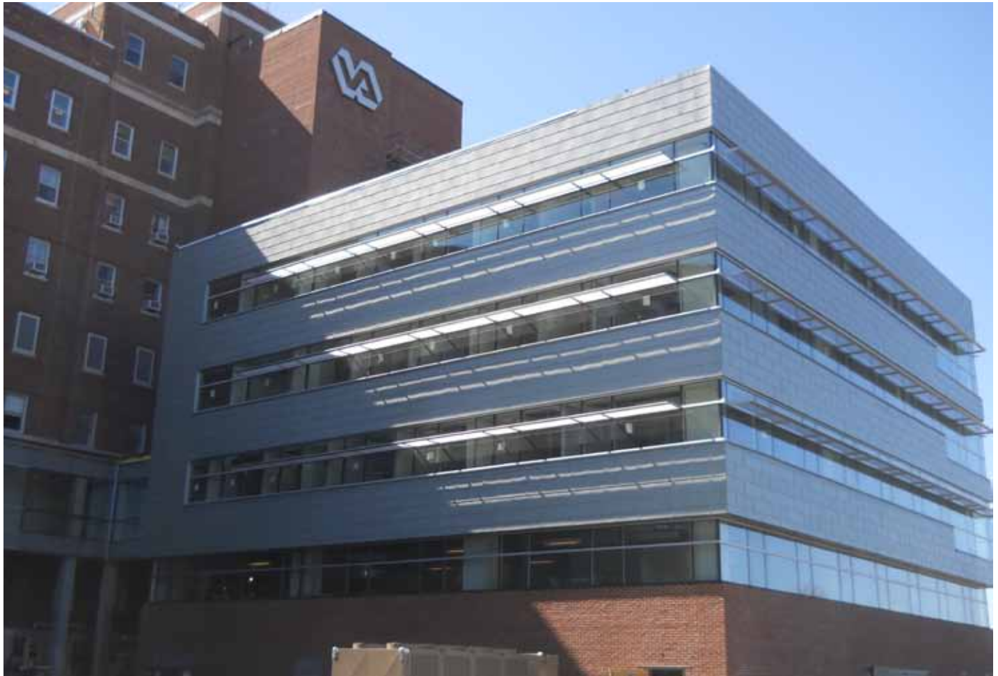
The new addition to the VA Providence Hospital in Rhode Island will provide state-of-the-art health care to Veterans.