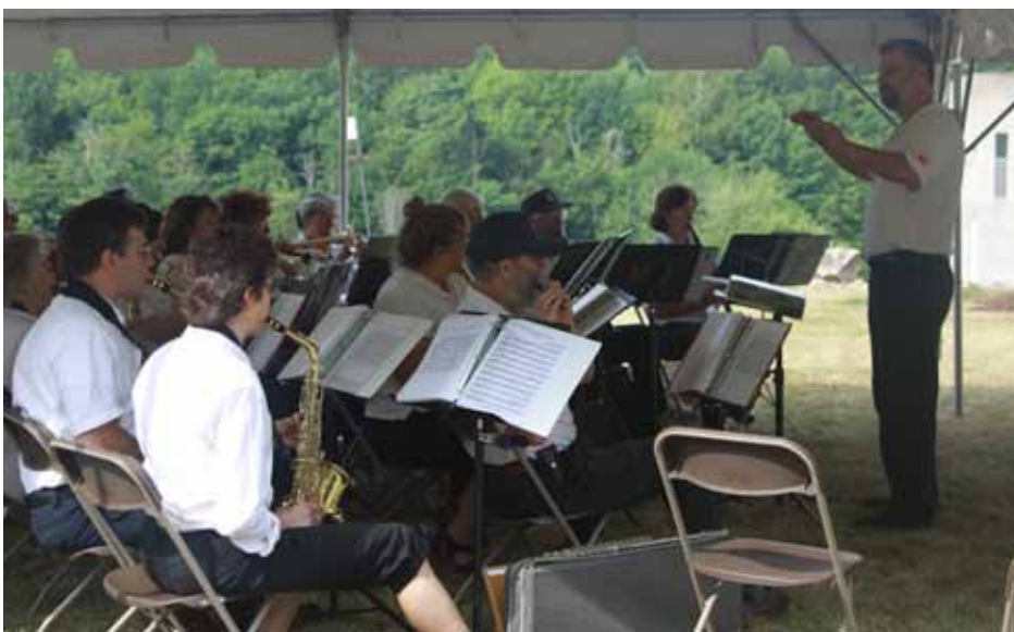
The Town of Hopkinton Band provided musical entertainment before and after the official ceremony.

There were historical exhibits at the event that documented the project construction, the natural disasters that were the catalysts of the project's con-