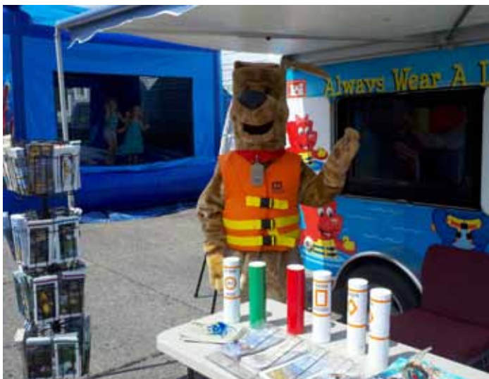
Bobber the Water Safety Dog was a special guest at the festival.