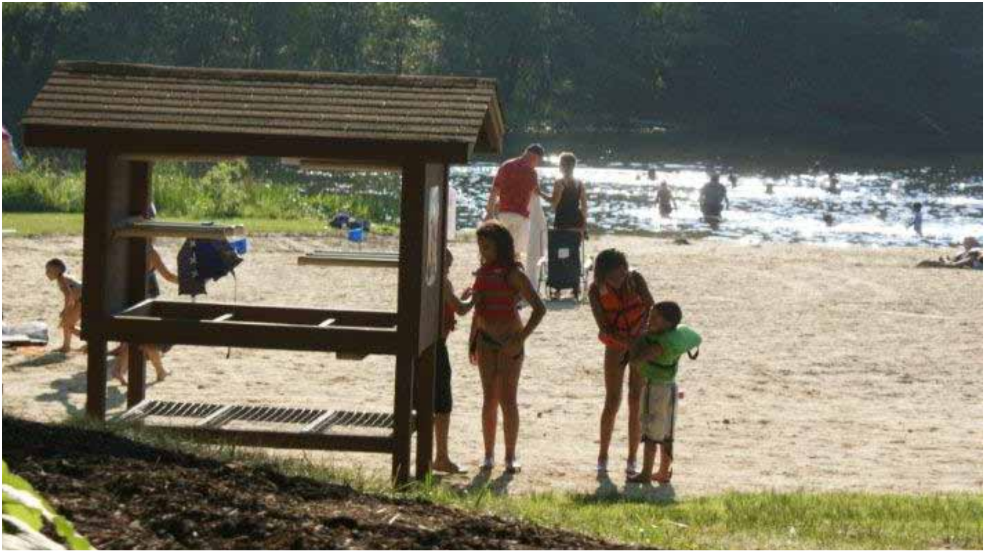
Children fasten life jackets provided by Buffumville Lake team members prior to entering the water.