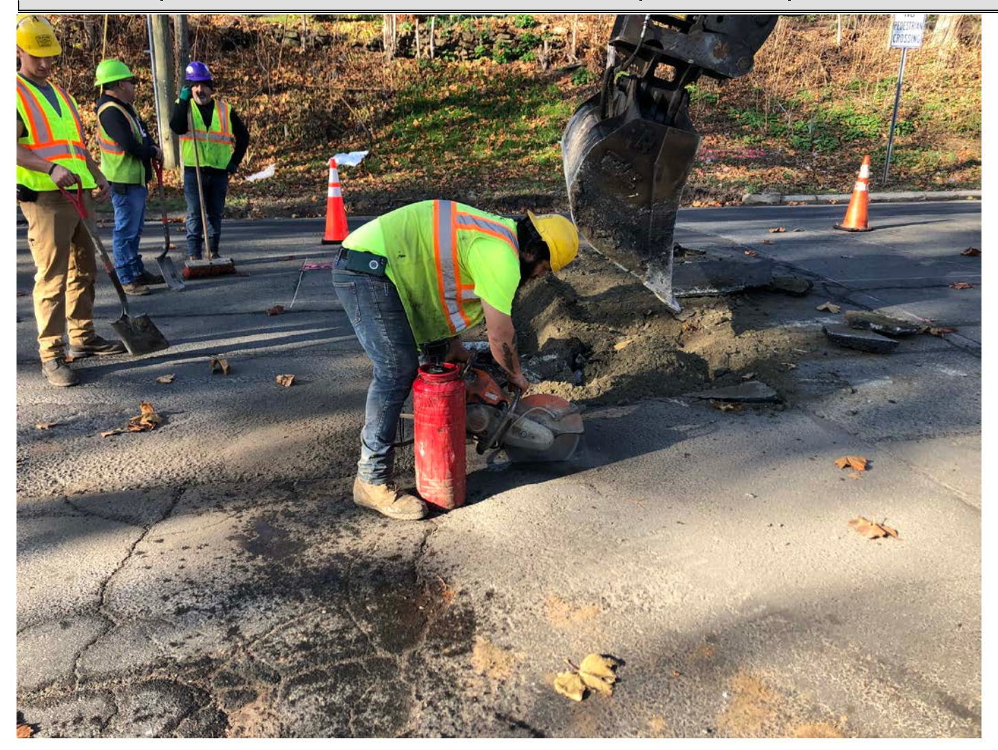
Picture 4: Ludlow saw cutting pavement at the intersection of Pickett Lane and the northbound lane of Main Street, Durham as part of permanent paving activities. View to the west.