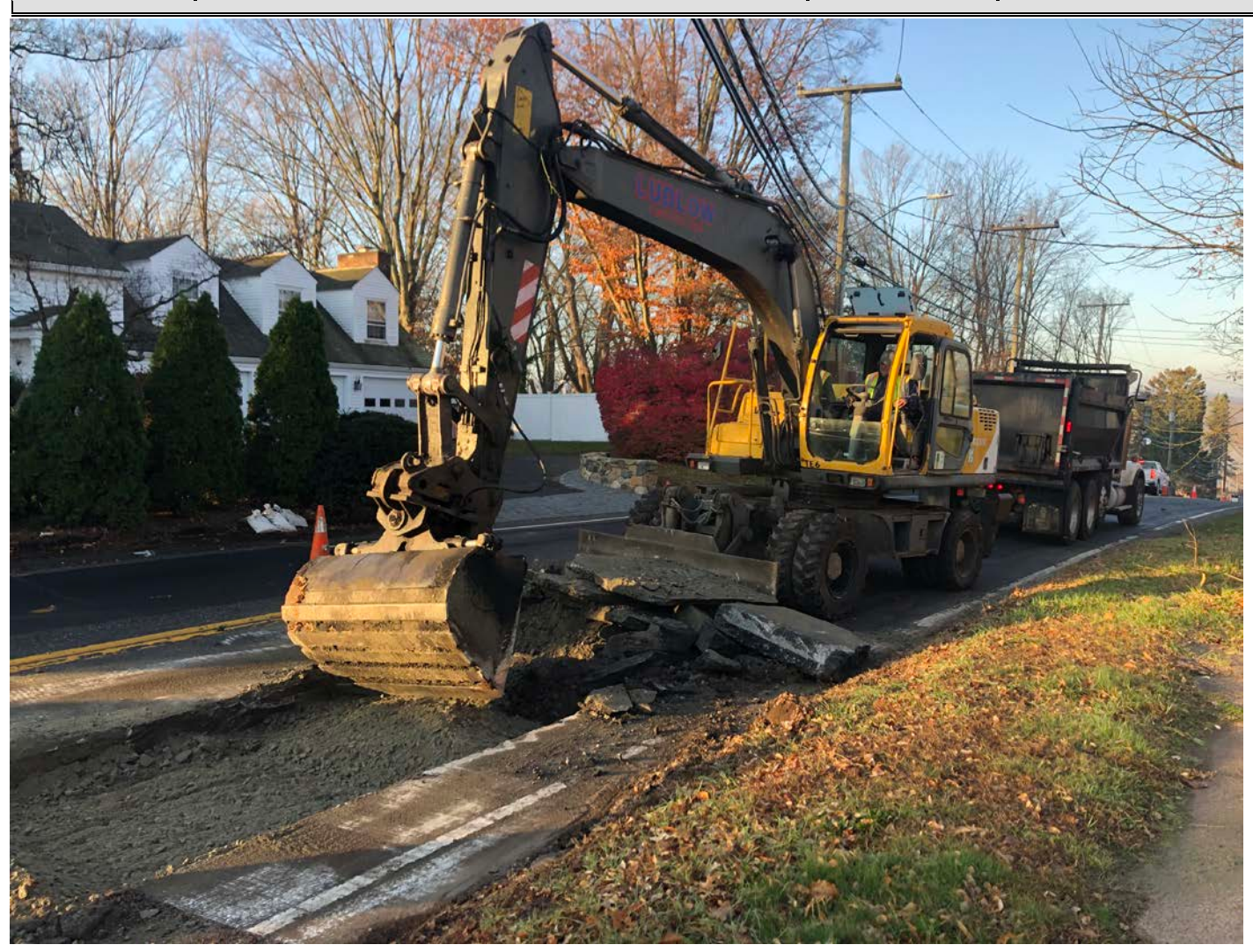
Picture 2: Ludlow stripping pavement from trench overcuts on the westbound lane of Route 68, Durham as part of permanent paving activities. View to the southwest.