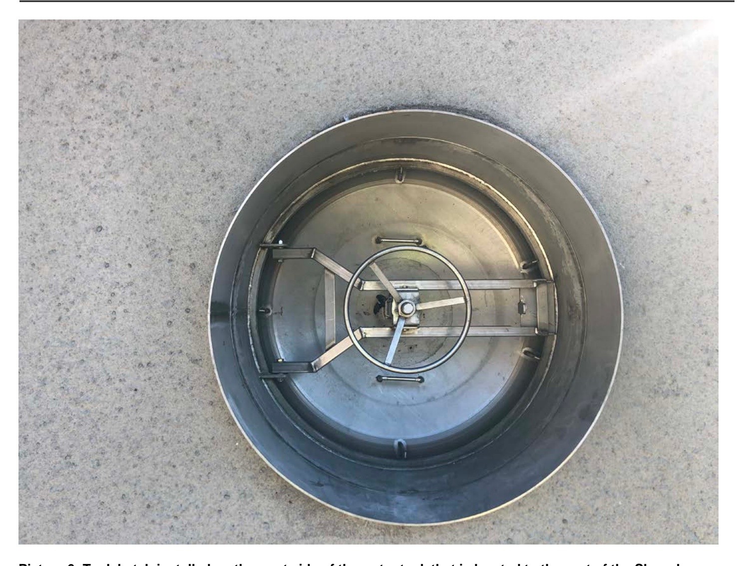
Picture 6: Tank hatch installed on the west side of the water tank that is located to the east of the Shared Access Driveway, Middletown. View to the east.