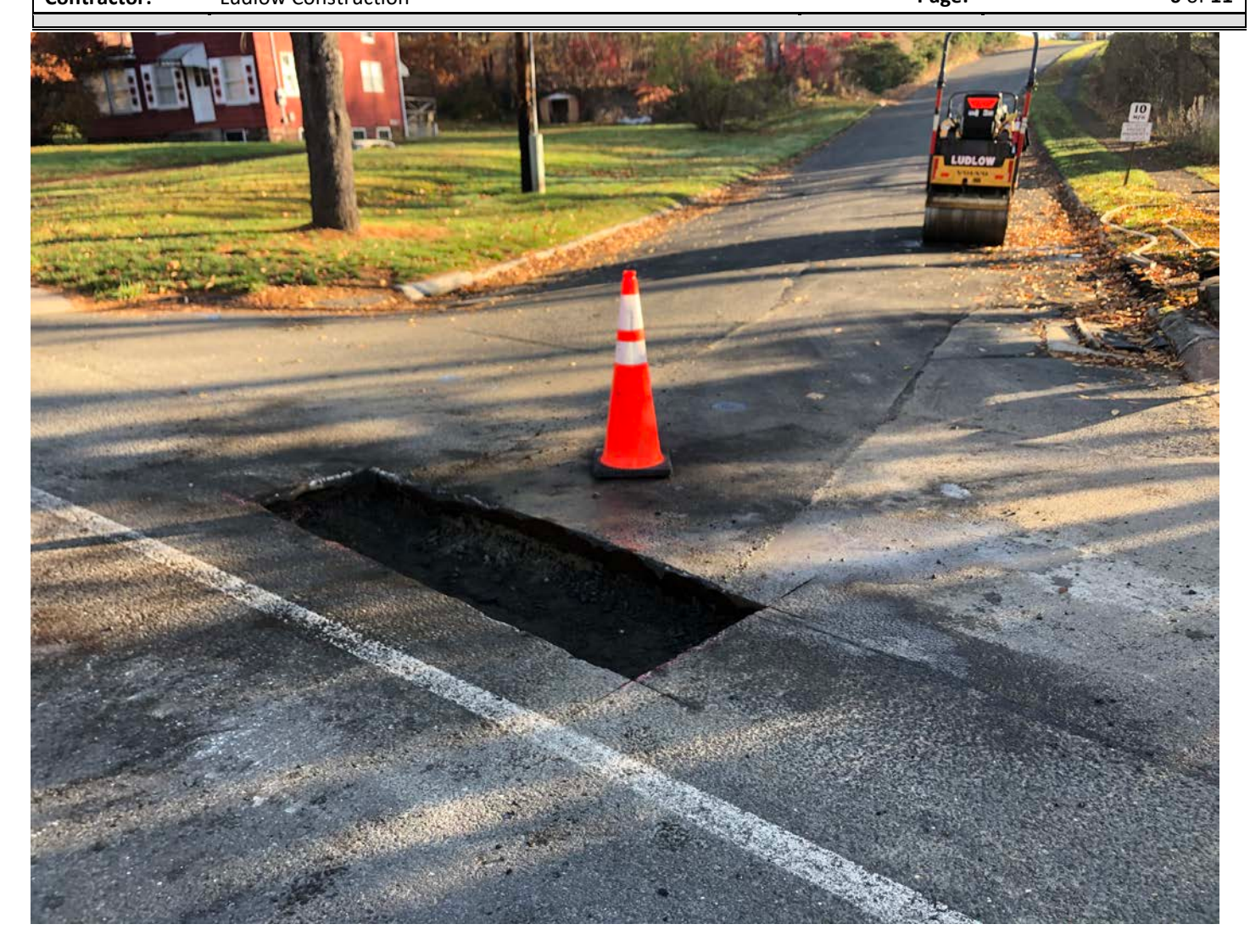
Picture 3: Pavement Ludlow excavated at the intersection of Mill Pond Lane and Main Street, Durham Station 209+51 as part of permanent paving activities on the northbound lane of Main Street, Durham. View to the northeast.

Res. Representative: J. Meunier Date: 11/09/20