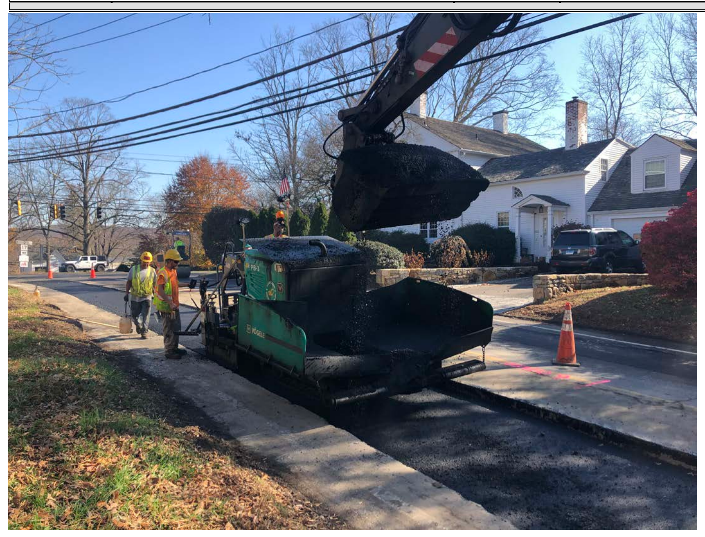
Picture 7: Ludlow placing the second of three 3" lifts of asphalt as part of permanent paving activities on the westbound lane of Route 68, Durham as part of permanent paving activities. View to the southeast.