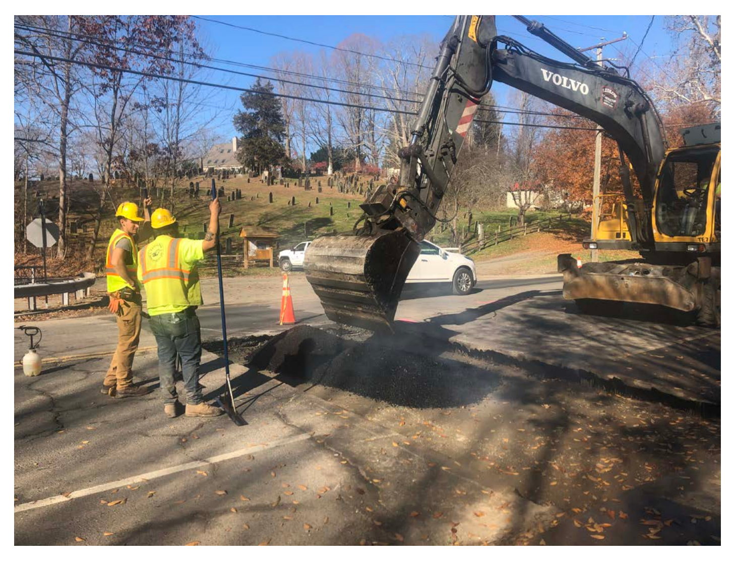
Picture 5: Ludlow placing the first of three 3" lifts of asphalt at the curb stop overcut located at Station 209+55 on the northbound lane of Main Street, Durham. View to the northwest.

Res. Representative:J. MeunierDate:11/09/20