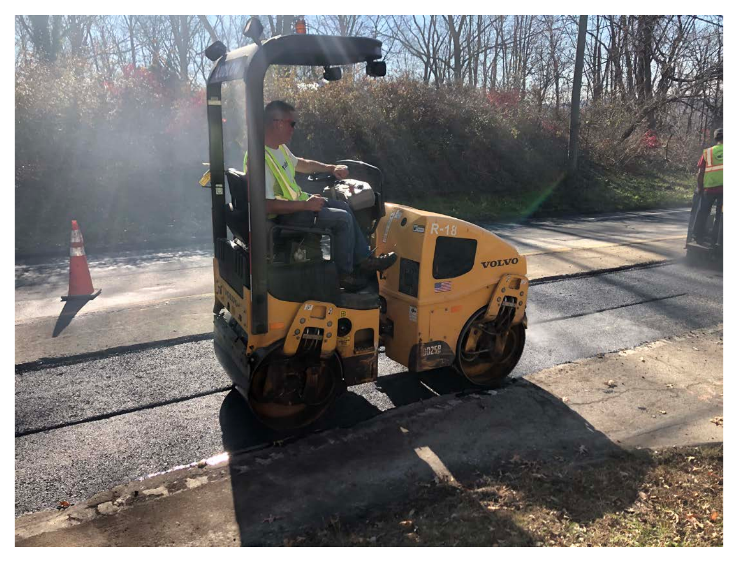
Picture 8: Ludlow compacting the second of three 3" lifts of asphalt as part of permanent paving activities on the westbound lane of Route 68, Durham as part of permanent paving activities. View to the southwest.

Res. Representative: J. Meunier Date: 11/09/20