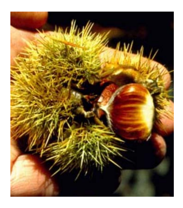
Chestnuts are a valuable food source for a variety of wildlife

In support of regional restoration efforts, more than 100 chestnut trees of various stages of backcrossing have been planted by Park Rangers and volunteers along the Cape Cod Canal.