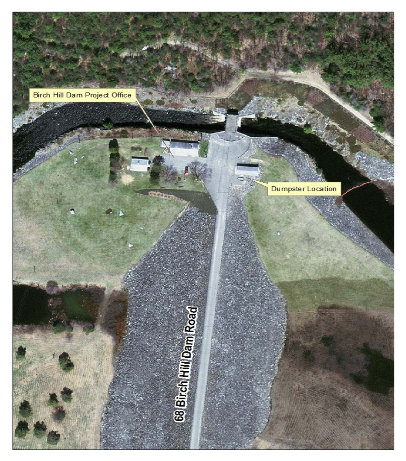
Figure Number 2 – Birch Hill Dam Project Office approximate location of trash dumpster container.