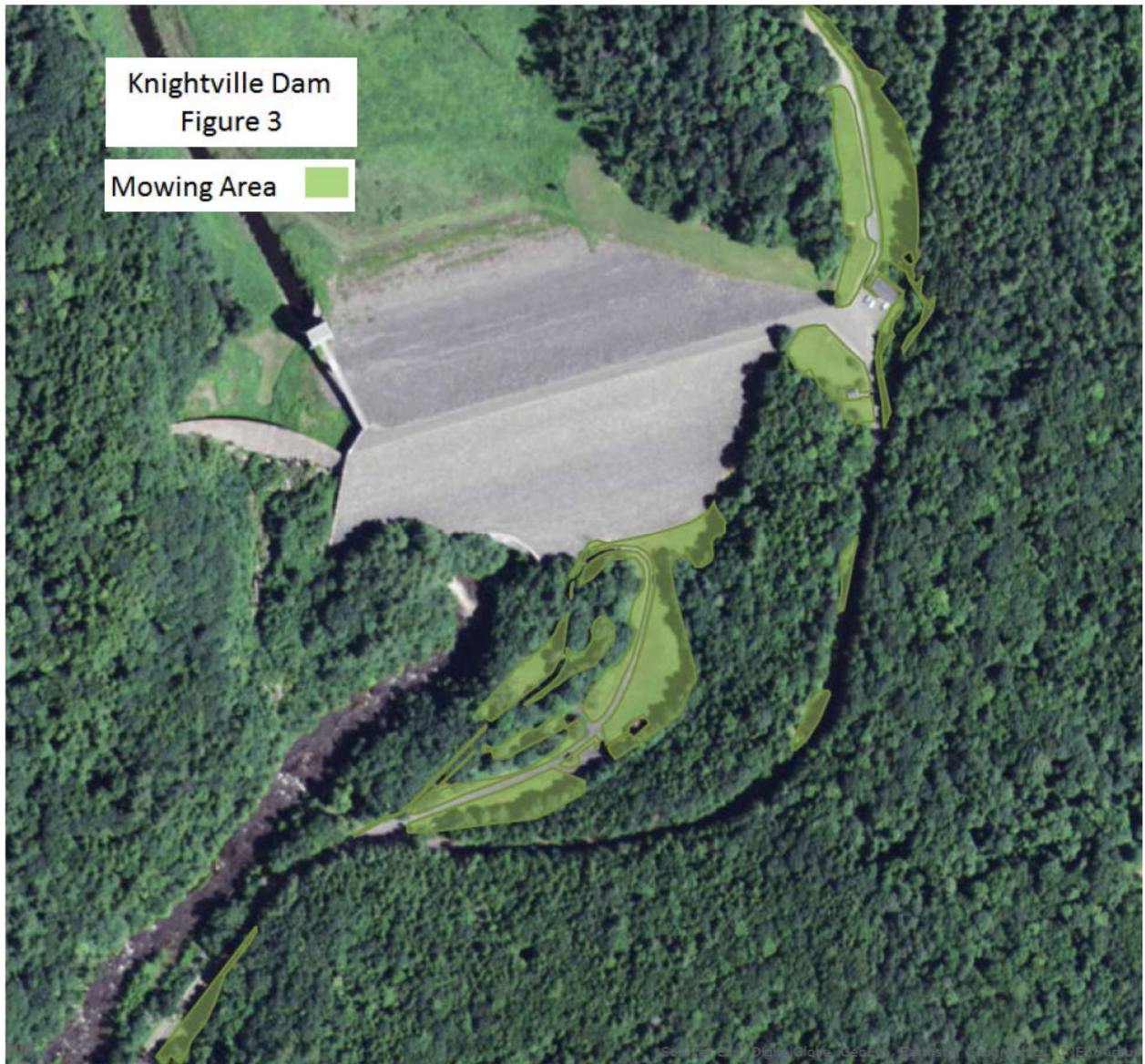
Figure 3: Knightville Dam mowing areas