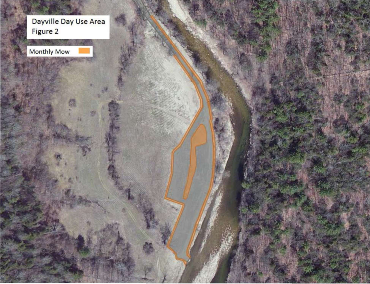
Figure 2: Dayville Canoe Launch mowing area