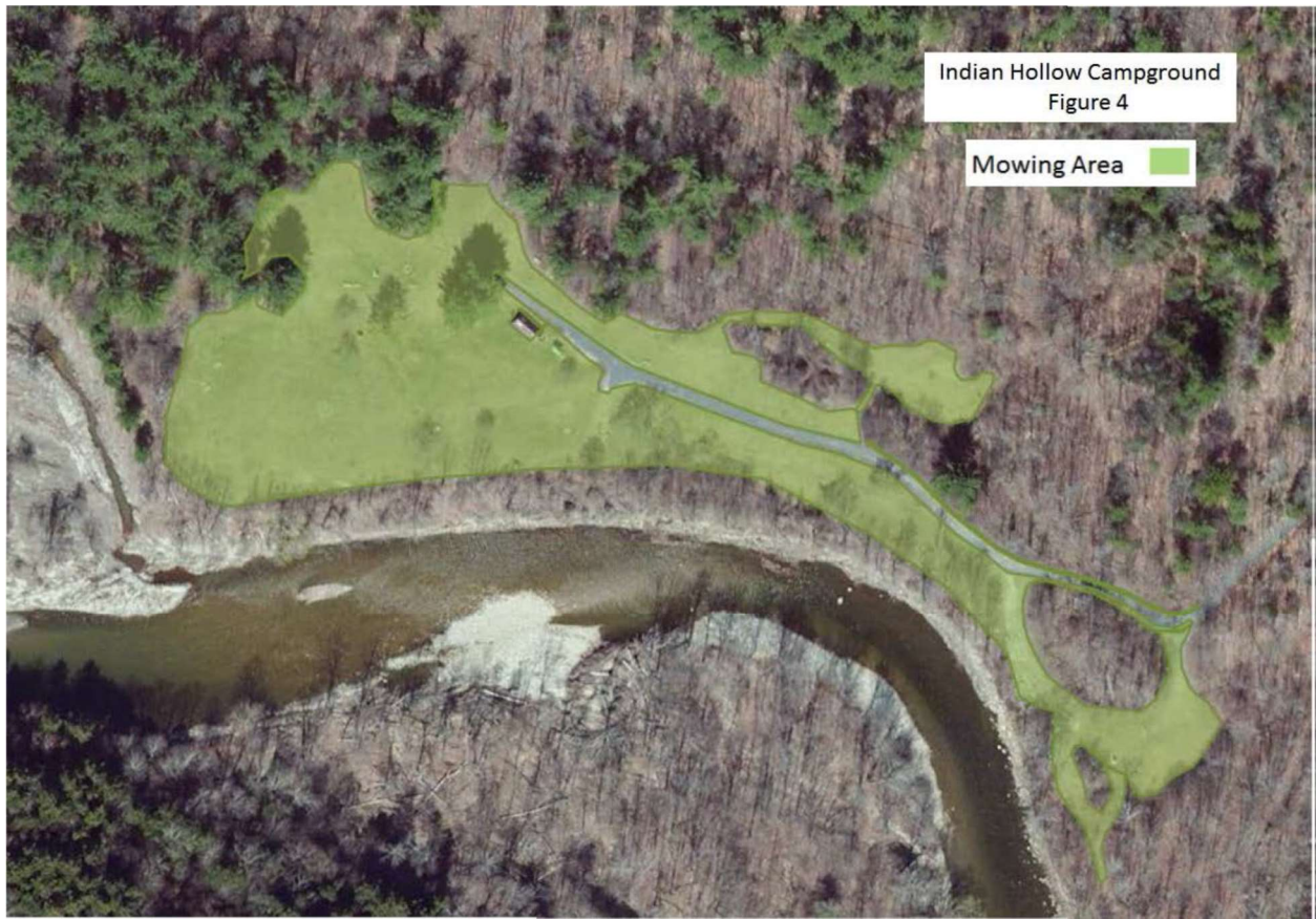
Figure 4: Indian Hollow Campground mowing area