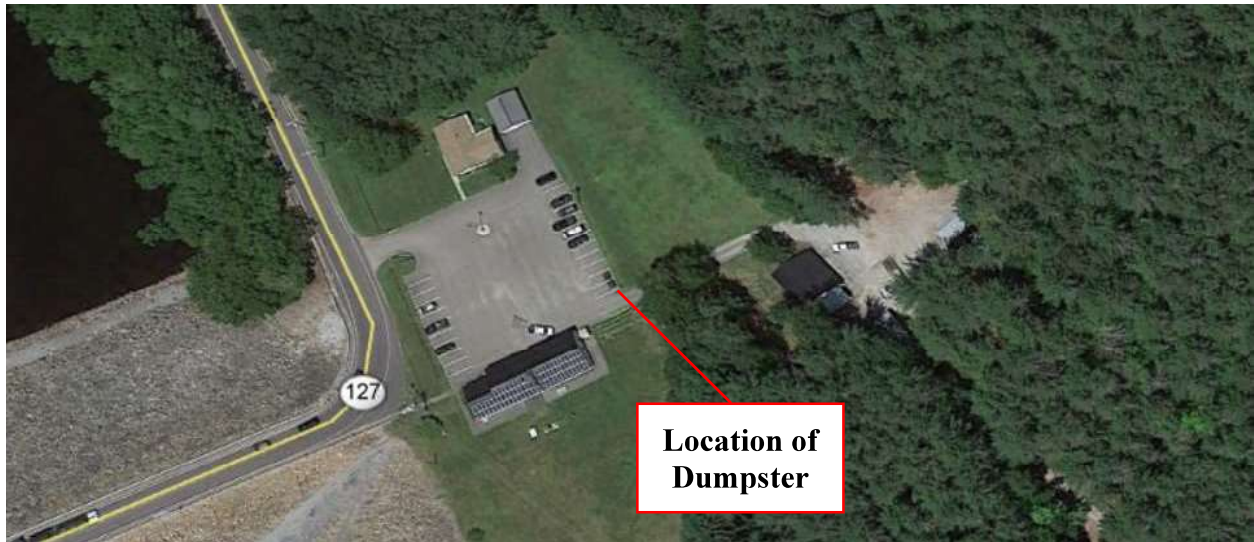
Informational Map 2: Location of the dumpster at the Hopkinton Project Office.