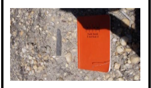
.50 caliber shell casing.