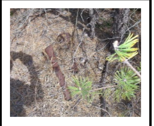
2.25-in practice rocket bodies.